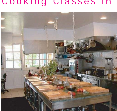
Mas de Cornud kitchen Photo Credit

A gem of a location - Mas de Cornud is a country inn with charm and a special ambiance located in the heart of Provence. Enjoy a week of indoor and outdoor culinary classes and tastings, farm and winery visits and shopping at local markets. There'll also be time for a Jacuzzi or swim in the pool and game of Pétanque.