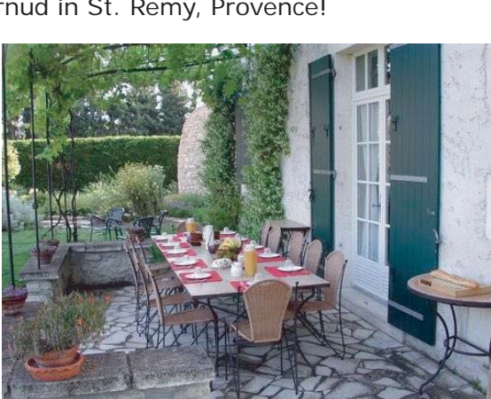
Mas de Cornud al Fresco Photo Credit

A gem of a location - Mas de Cornud is a country inn with charm and a special ambiance located in the heart of Provence. Enjoy a week of indoor and outdoor culinary classes and tastings, farm and winery visits and shopping at local markets. There'll also be time for a Jacuzzi or swim in the pool and game of Pétanque.