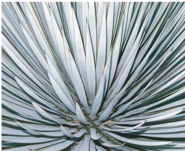
Blue Agave Photo Credit