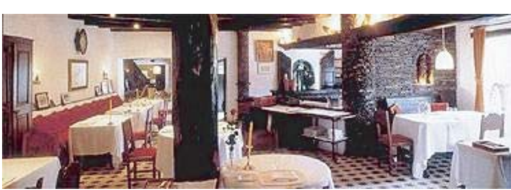
El Bulli Photo Credit